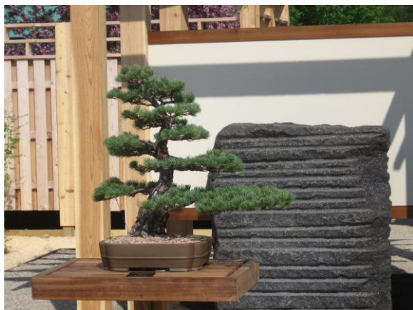
Japanese White Pine on display in the garden

The meeting starts at 7 PM with the evening program to follow.