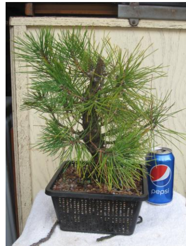
Black Pine for Workshop with Julian Adams (typical of the pine available)

Material - Black pine, 7-9 years old - $40 each, Black pine seedling, 3 years old - $10/ea.