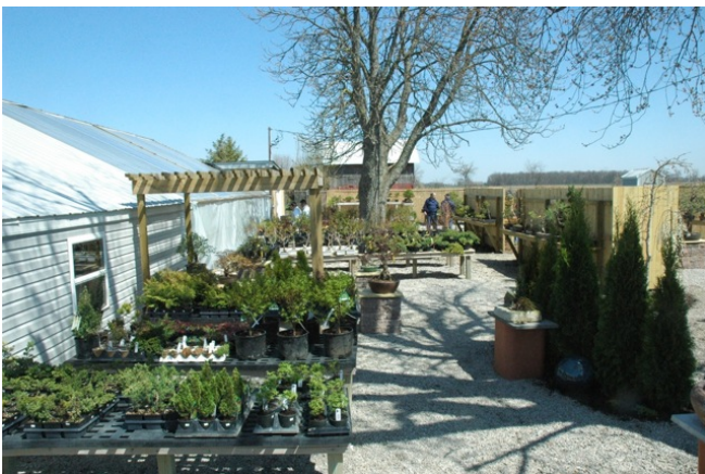
A Peak Into The Garden From The Entrance