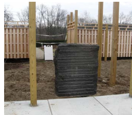
Granite Slab at Entrance To Garden File photo

During our May Monthly Meeting, members of the Bonsai Society will have an opportunity to examine the new acquisitions displayed in the garden.