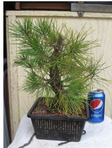
Black Pine for Workshop with Julian Adams (typical of the pine available)

Material - Black pine, 7-9 years old - $40 each, Black pine seedling, 3 years old - $10/ea.